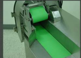
Food Grade Conveyor 食品級輸送帶