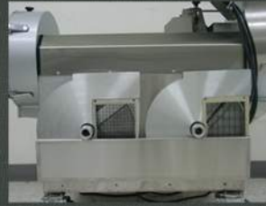
Blades Shelf 不占空間刀架

適用於各種葉菜類與根莖類蔬菜:如 蔥、韭黃、芹菜、高麗菜、大白菜、蘿蔔、馬鈴薯、竹筍、洋蔥、瓜類、茄子等。