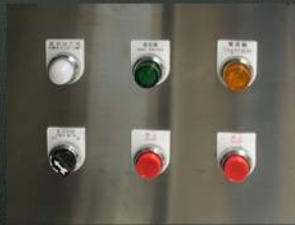
Control Panel 控制面板