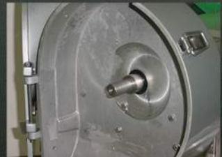
Power Safety Equipment 安全裝置